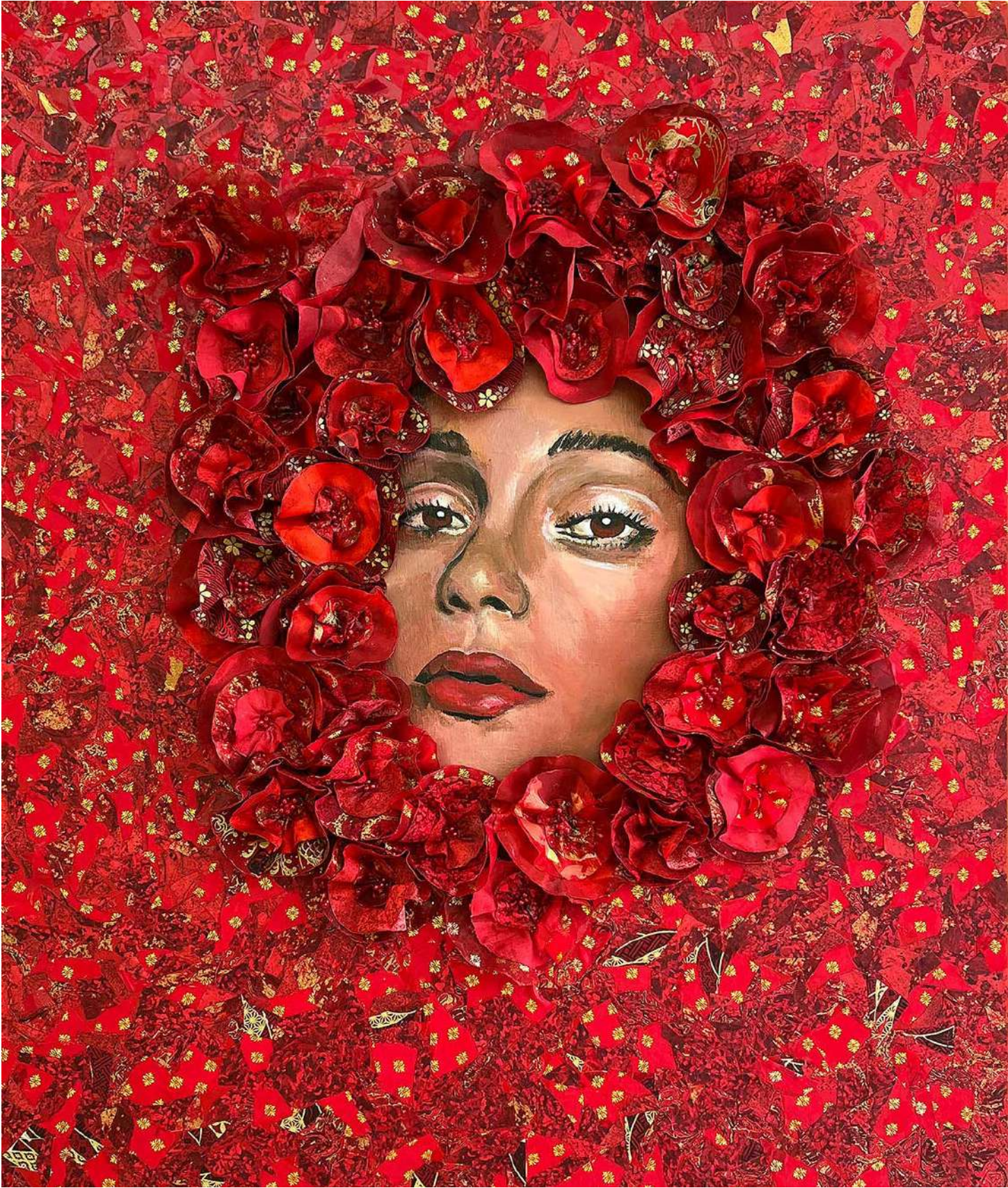
Art by Ghia Haddad - Emirati - Dubai